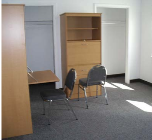
Newly remodel room in Friends Hall.

It all began in late April when it became obvious that our fall enrollment was going to exceed our expectations. Traditionally Hillsdale has enrolled more men